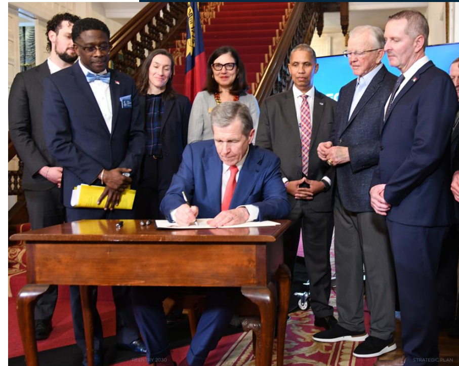
Photos from NC Reentry 2030 Strategic Plan