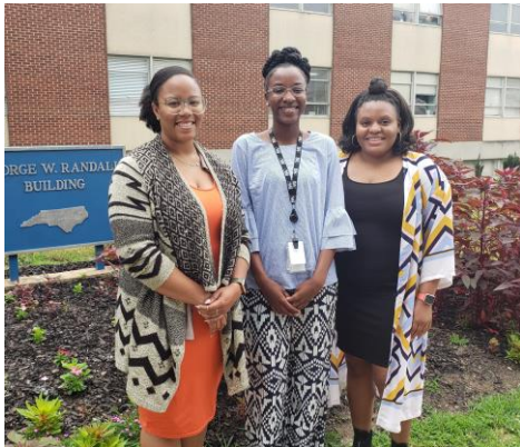
2020-2021 Intern Class

The internship training sites (Central Prison, NC Correctional Institution for Women, and the Post-Release Supervision and Parole Commission) provide a broad and representative cross-section of the prison population allowing intern training experiences and case assignments from a variety of individual and clinical presentations. As noted earlier, the clientele is highly diverse. The prison population also demonstrates a growing number of incarcerated individuals who identify as transgender and are in various stages of gender-affirmation transition.