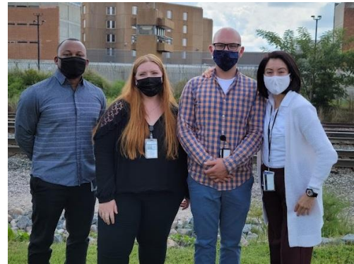
2021-2022 Intern Class

Central Prison is a male prison that offers outpatient psychological and psychiatric services within five distinct populations (Death Row, Restrictive Housing, Pre-Trial Detainees, Assessment/Diagnostic Center, and Regular Population). Attached to the prison is the Central Prison Healthcare Complex (CPHC). The CPHC is the main hub for the department to address both the acute mental health and intensive medical needs of the entire male correctional population of North Carolina.