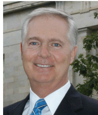
Governor Michael F. Easley

The Victims Committee in the early 1990s sought to improve the criminal justice system's capacity to better serve victims of crime through the Violence Against Women Act (VAWA) and Victims of Crime Act (VOCA) funds. By utilizing VOCA, the committee sought to improve the delivery of victims' services. Both goals required increasing input by experts and practitioners who participated in the Victims Committee meetings. Leadership combined VOCA and VAWA functions under one umbrella in the mid 1990's to better address programming needs for all crime victims by creating the current Crime Victims Services Committee.