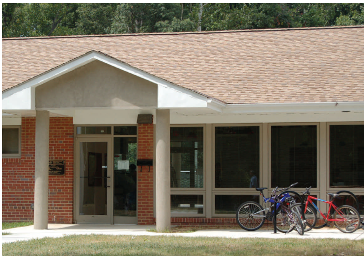
Reidsville's Teen Center provides programs for youth in an effort to reduce juvenile delinquency and gang participation.

Governor Michael Easley charged the Governor's Crime Commission to address the issue of providing sound educational services for those youth who are either suspended or expelled from their home school, a decision augmented by a study done on alternative learning programs by the commission's Criminal Justice Analysis Center. The Structured Day program is an exemplary program in this area.