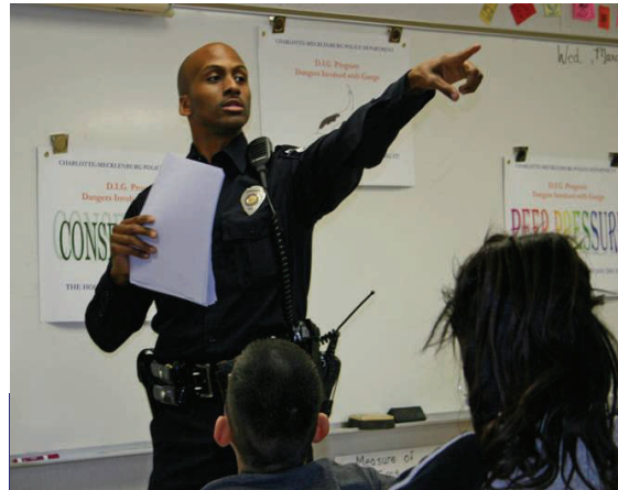
'Dangers Involved with Gangs' (DIG), sponsored through the Charlotte-Mecklenburg Police Department's 'Gang of One' program, helps fifth grade students resist the pressure to join a gang.

The Commission has taken a leadership position on communicating and confronting the North Carolina gang issue. The Criminal Justice Analysis Center, the research section of the Commission, began studying the issue of gangs in 1999 with a statewide survey of law enforcement agencies, school resource officers and juvenile court counselors. This statewide systemic survey was replicated in 2004 and again in 2007. As a result of this research and the Commission's proactive role in addressing this issue, the General Assembly awarded the Commission $1.5 million in FY 2006-2007 to fund grant programs that dealt with suppression, intervention and prevention of gangs and gang-related crime. Given the success of this initiative, the General Assembly increased its appropriation the following year to $4.8 million with an additional $10 million being awarded in FY2008-2009 for gang intervention and prevention program development. More than 50 programs were created or expanded as a result of this state funding. Furthermore, the Criminal Justice Improvement Committee funded 31 gang prevention programs with $1.4 million in federal funds.