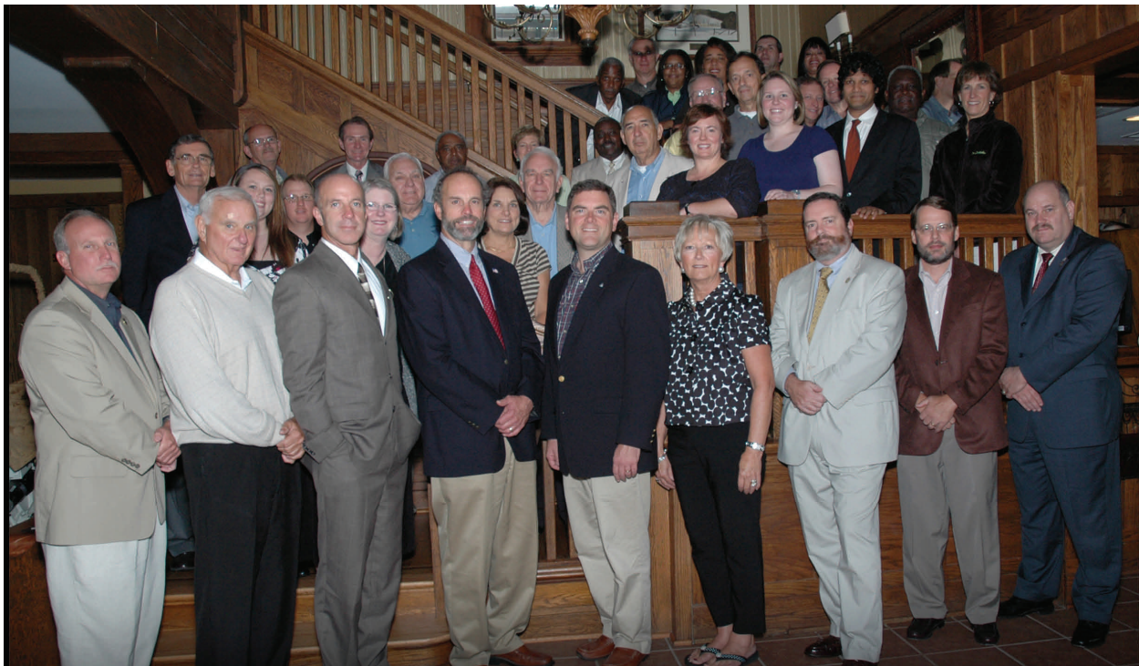
The Governor's Crime Commission, September 2008