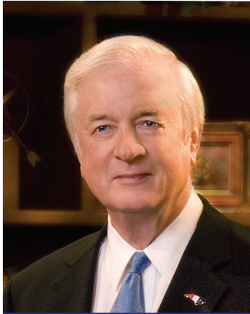
Governor James B. Hunt

Committee structure and purposes varied over time depending on issues and criminal justice system needs. In the early 1990's the predecessor of the Criminal Justice Improvement Committee (CJI), the Drug Control and System Improvement (DCSI) Committee, split with the creation of the Information Systems and Technology (IT) Committee. The significance of the IT Committee was that it made automation systems, mobile data, and universal communication among criminal justice stakeholders a priority for policy and funding. Internally, the IT committee was a platform for introducing a grant scoring matrix which helped Commissioners be as objective as possible while selecting grants. They had a tool to numerically objectify a very subjective process. With it, they could understand how effective a project may prove to be and discuss the merits of project selections with fellow commissioners. The matrix was then adopted by the other standing committees. In 2003, the DCSI and IT committees were combined into the present CJI committee mainly to reflect the reduction of Justice Assistance Incentive Block Grant and Byrne/Justice Assistance Grant funding, which eventually led to a 67 percent reduction of funds for CJI projects. The reductions led to smaller dollar value projects to support more department level operational needs with less latitude for experimentation on new ideas.