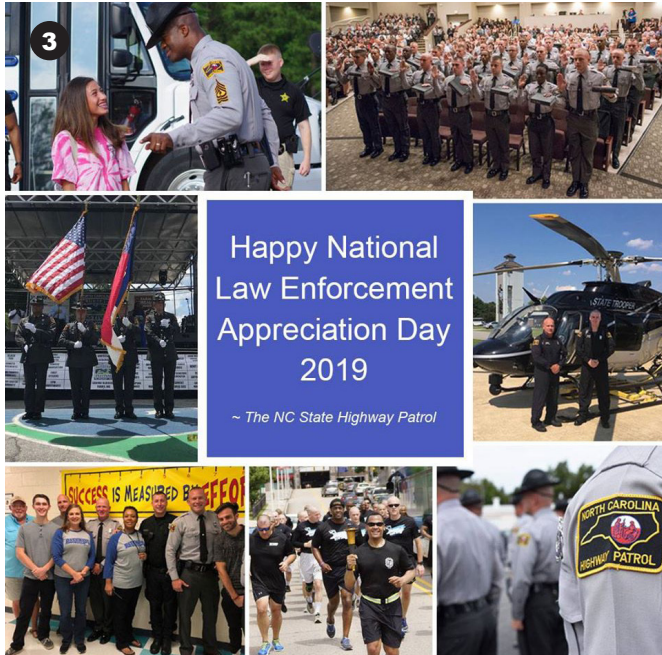
Happy National Law Enforcement Appreciation Day 2019 ~ The NC State Highway Patrol

3) More than 260,578 people reached: The North Carolina State Highway Patrol would like to thank all law enforcement personnel across the country for their tireless and unwavering efforts to serve their communities. Happy National Law Enforcement Appreciation Day to the men and women who leave their families each day to protect others. Please join us in thanking members of the law enforcement community today who selflessly protect and serve.